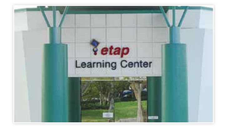
ETAP Learning Center 17 Goodyear, Suite 100 Irvine, CA 92618

Afternoon transport back to Hotel Irvine @ 17:00. Pick up location in front of ETAP Learning Center