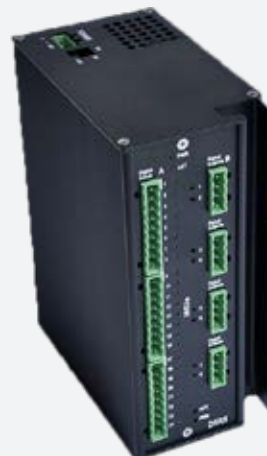
RTUe I/O Unit