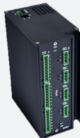
RTUe I/O Unit